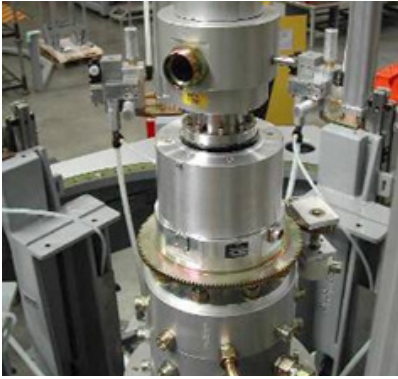
Universal air rotary union on Series 2