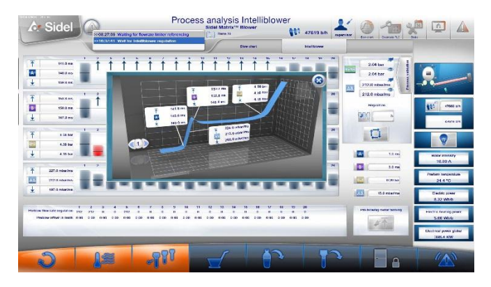
The Sidel Intelliblower<sup>™</sup> eliminates inconsistencies of material distribution by analysing and controlling the blowing curve on each individual PET bottle.

Sidel is constantly striving to challenge the conventions of PET production and rise above the expectations of beverage producers. For more information on Sidel Matrix blowers, please visit sidel.com/matrix-blower.