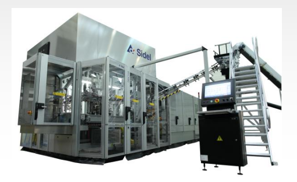
Sidel Matrix<sup>™</sup> blowers are engineered to create the highest PET bottle quality and performance.

Editors Note: The images within this document are for illustrative purposes only and should not be used for reproduction. If high resolution copies are not attached with the document, please contact Chris Twigger at Shaw & Underwood PR for copies – see contact details below.