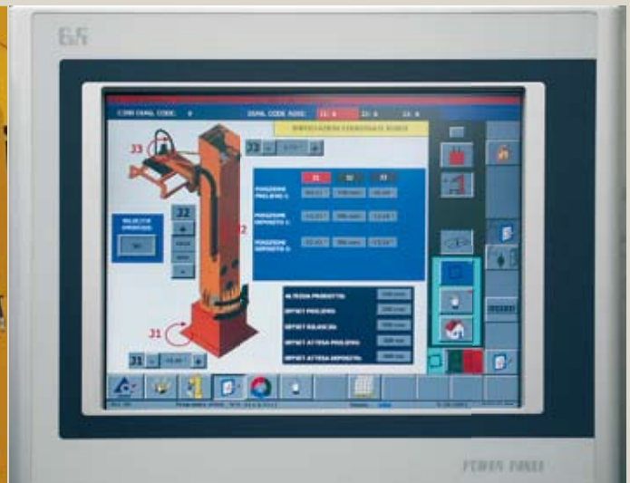
HMI touch screen 12"