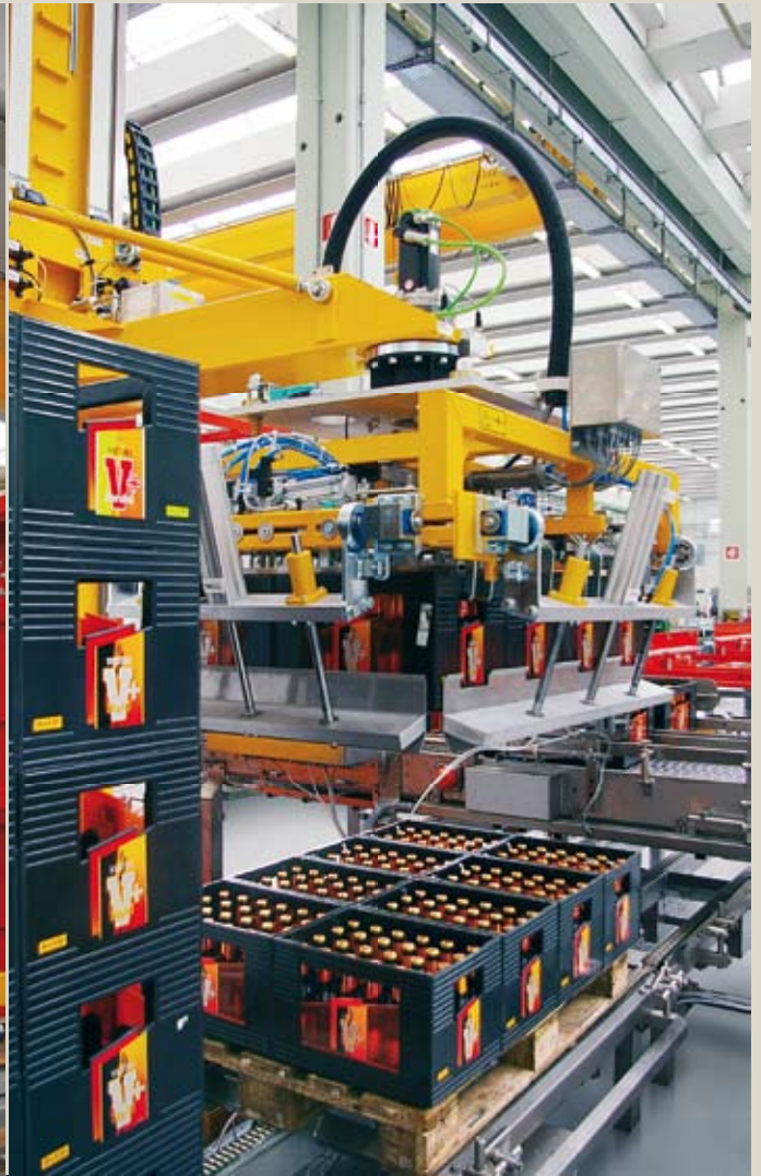
Transfer head with centering device and hooks for gripping crate layers at the sides