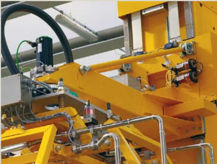
Toothed belt during lifting

Consisting of a male grip (installed on the robot) and a female grip (on each head), the system is designed according to the concept of "intrinsic security." The presence of a dedicated tool area enables operators to carry out preparation and/or maintenance activities on individual heads off-line while the robot continues to work. The operator-machine interface consists of a touch screen, providing information about the state of the system peripherals, and a programming unit.