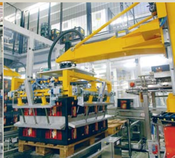
Robo-Column crate palletizer