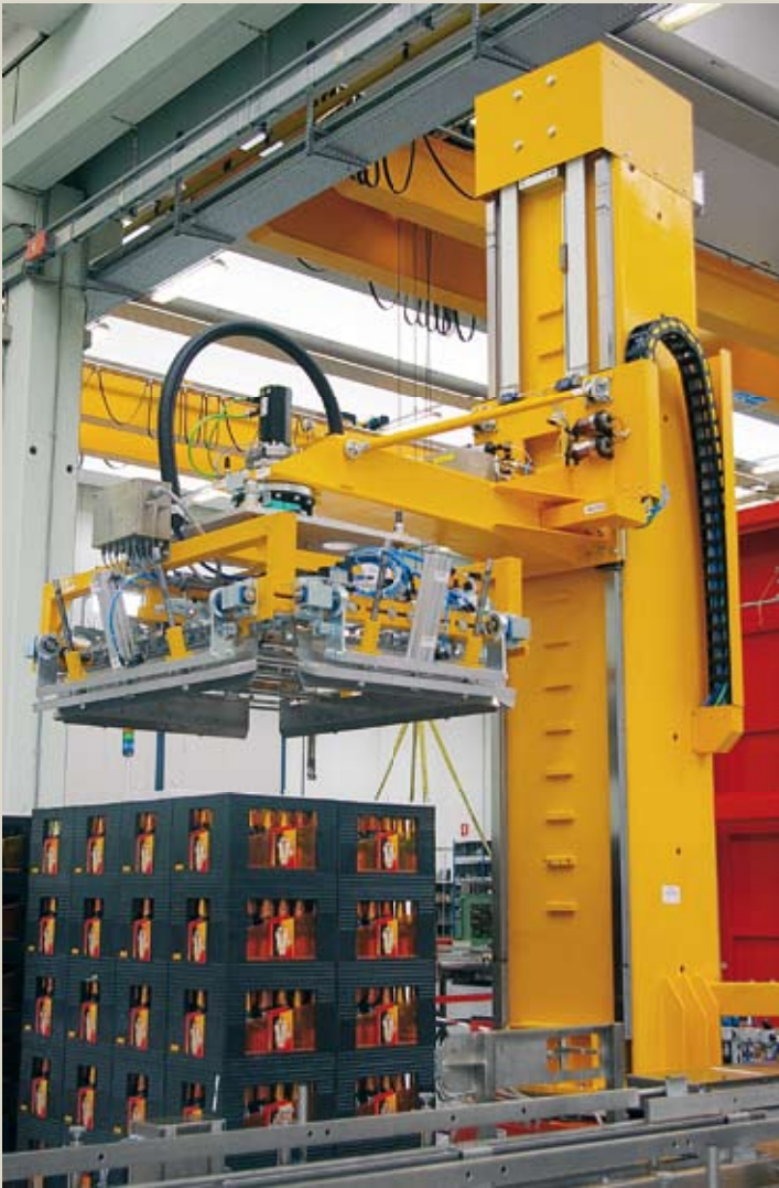
Single column main structure and lifting arm in painted steel