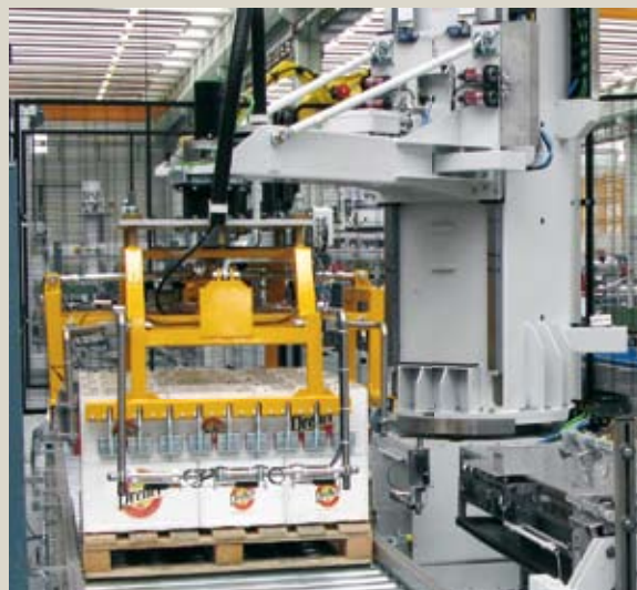
Robo-Column crate depalletizer