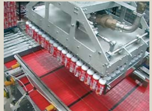
Filled cans sucking gripping head