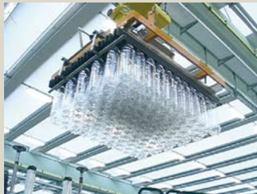
Empty PET bottle gripping head